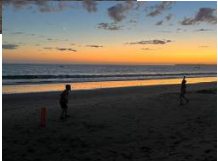
Even when the sun went down.