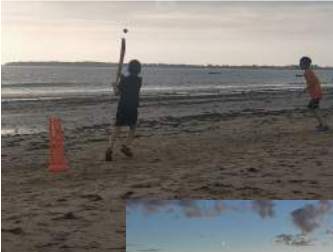
Two young Middlesex members honing their skills.